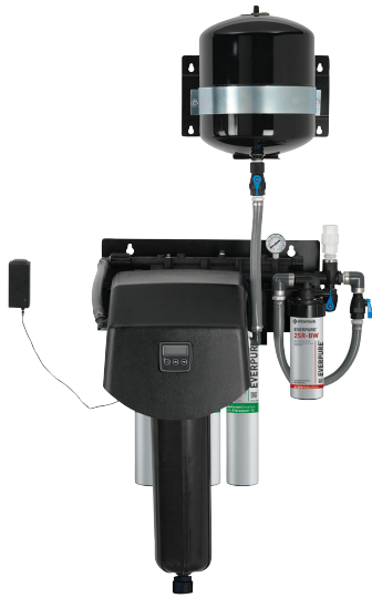
Endurance High Flow Triple: EV9437-41

ALL THE BENEFITS OF THE ENDURANCE PLATFORM PLUS ULTRAFILTER MEMBRANE-BASED PRETREATMENT