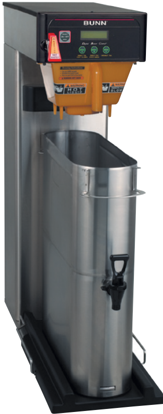
Model ITCB with TDO-N Dispenser and Locater Guide

(dispenser and locater guide not included) Dimensions: 34.37" H x 11.53" W x 23.78" D (87.3cm H x 29.3cm W x 60.4cm D)