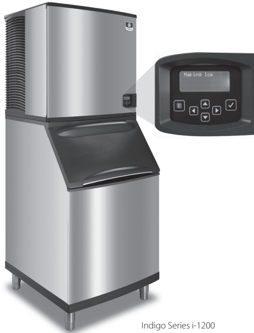
Indigo Series i-1200 Ice Machine on B-570 Bin

Designed for operators who know that ice is critical to their business, the Indigo™ Series ice machine's preventative diagnostics continually monitor itself for reliable ice production. Improvements in cleanability and programmability make your ice machine easy to own and less expensive to operate.